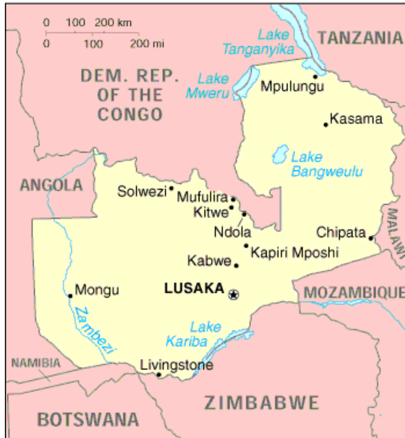
Figure 1: Zambia - the geographical boundary of the proposed PoA